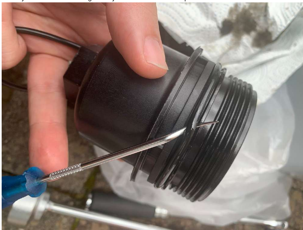
Exchange o-ring on housing ( use a pick easiest way i found )