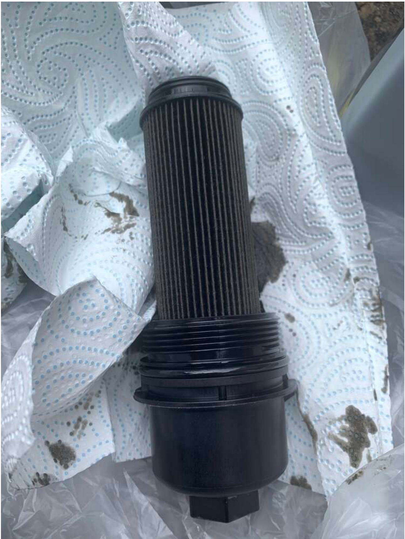
Oil filter and housing out of the car