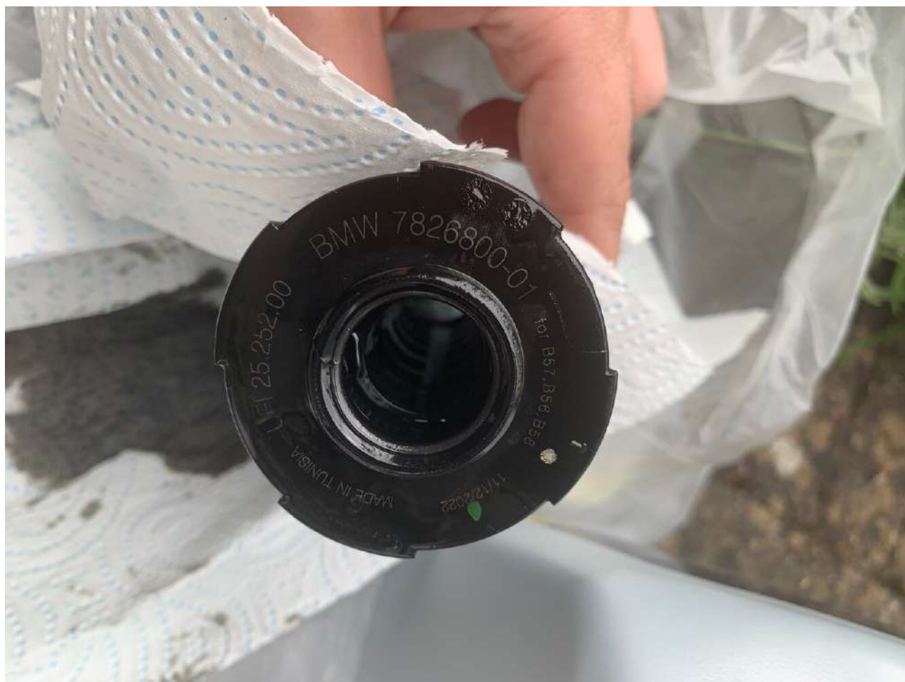
Factory filter . Same marking exactly as the one in the kit i posted above .