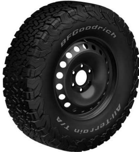
17" RIM - LT265/70R17 121/118S