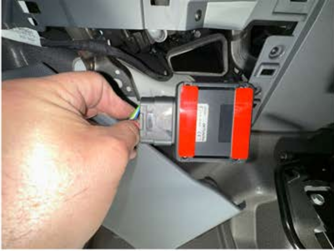
13. Apply two strips of the supplied double sided adhesive tape to the module as shown.