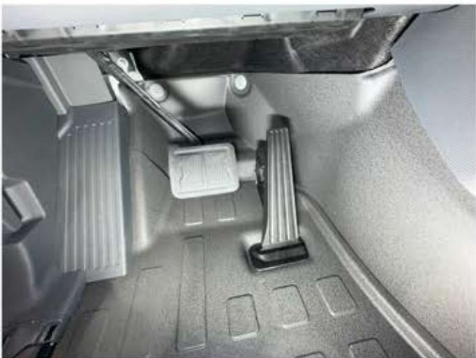
17. Re-install the two front floor mat nuts clips.