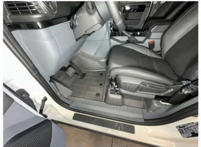
16. Re-install the center floor mat and the door sill molding.