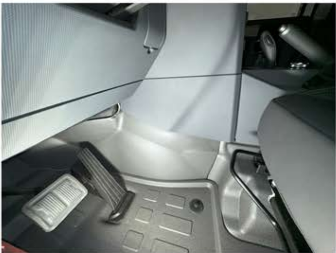
15. Re-install the center console side panel.