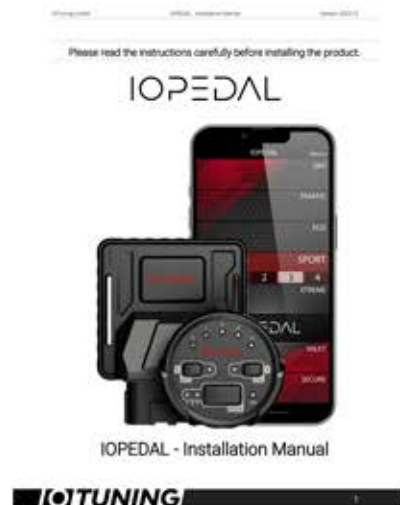
18. Refer to IOPEDAL Quick Start Guide programming and drive settings.