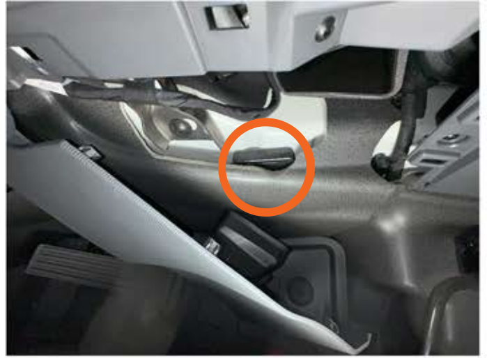
14. Adhere the module to the transmission tunnel behind the flooring.