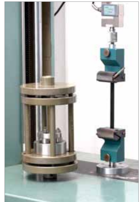
Figure 4: Race-Tec tensile test machine